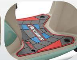
Floor Mat Red