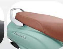
Seat Cover Brown