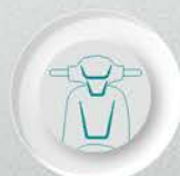
Iconic U-Shaped Design