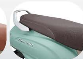
Seat Cover Dark Brown