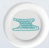
3D & Non-Slip Grids Floorboard