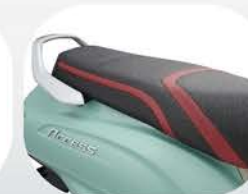
Seat Cover Maroon