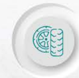
Low-Rolling Resistance Rear Tyre