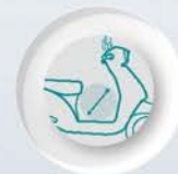
Ø305 mm Bottom Leg Space