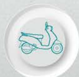
Classic Urban Styling