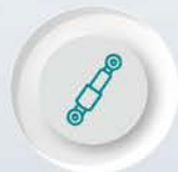
Telescopic Front Suspension