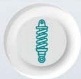
Swing Arm Rear Suspension