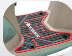
Floor Mat Black