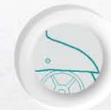
Steel Front Fender & Leg Shield