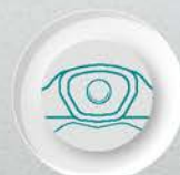
LED Head Lamp