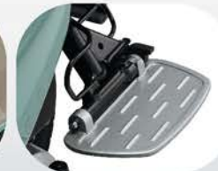
Rear Foot Rest