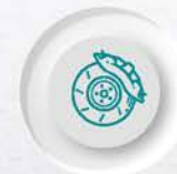
Front Disc Brake