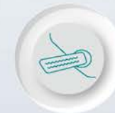
Aluminium Foot Rest