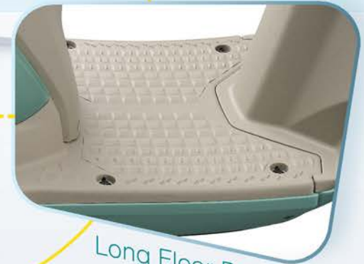
Long Floor Board