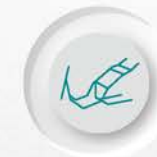
Highly Rigid Frame