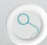
Chrome Finish Mirrors