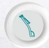
Side Stand Interlock